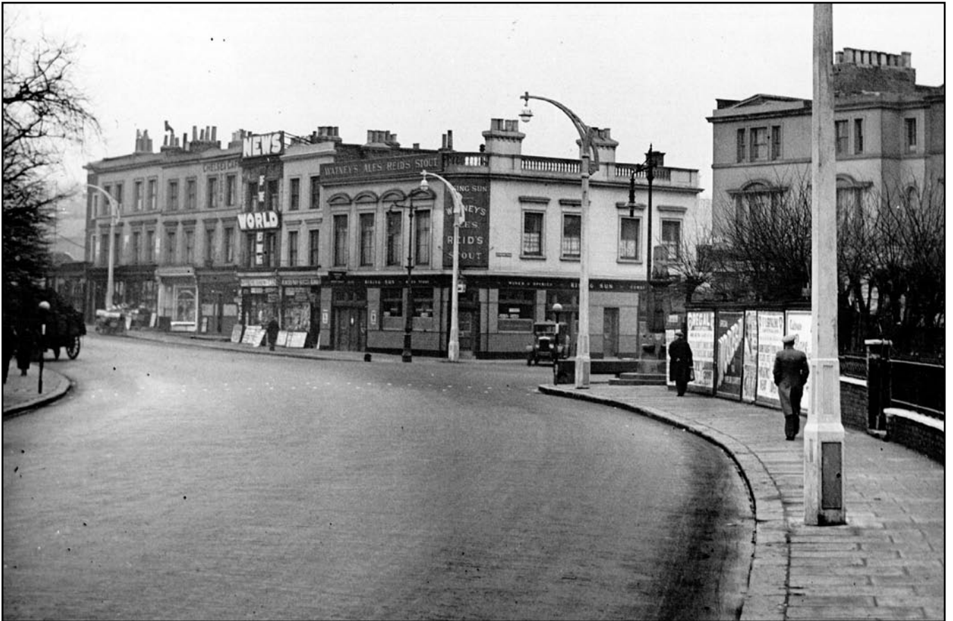
Fulham Road about 1955.

Find where this photograph was taken from.